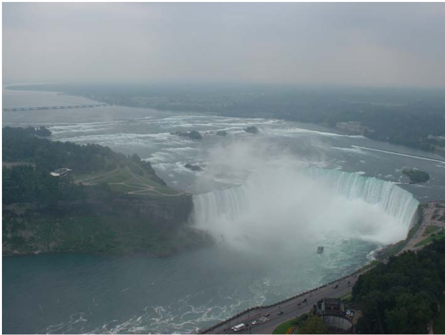
Horseshoe Falls as seen from Skylon CN Tower, Toronto, Canada