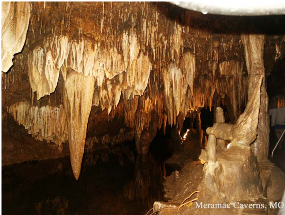
Meramac Caverns, MO