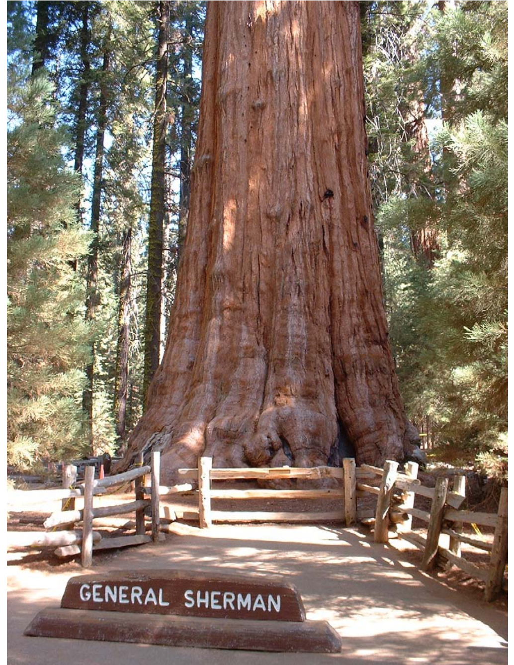
The General Sherman Tree, the largest living thing on earth