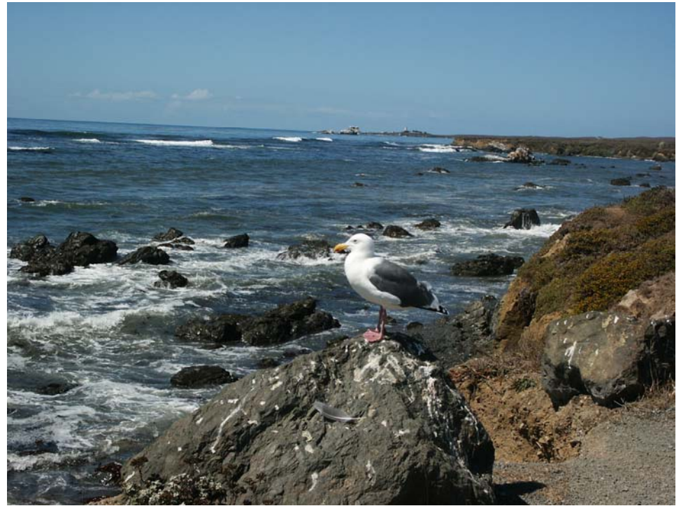
Pacific Ocean, along the US Route 1, California