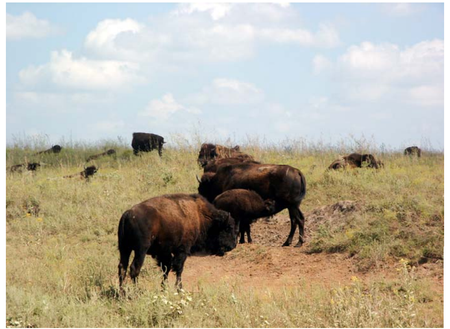
Chisholm Trail Watering Hole, Yukon, Oklahoma