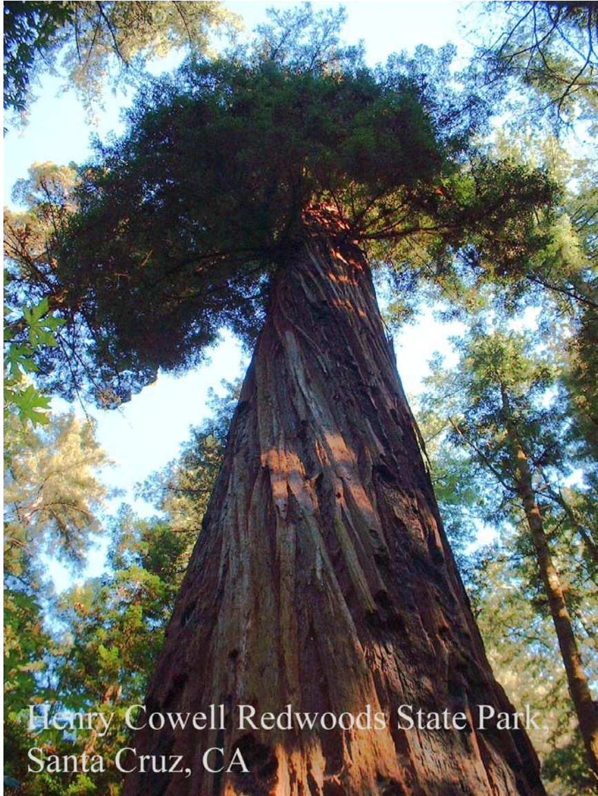
Henry Cowell Redwoods State Park, Santa Cruz, CA