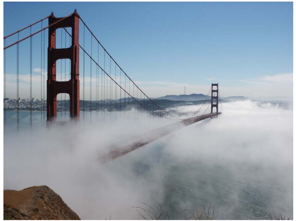
Golden Gate Bridge, San Francisco