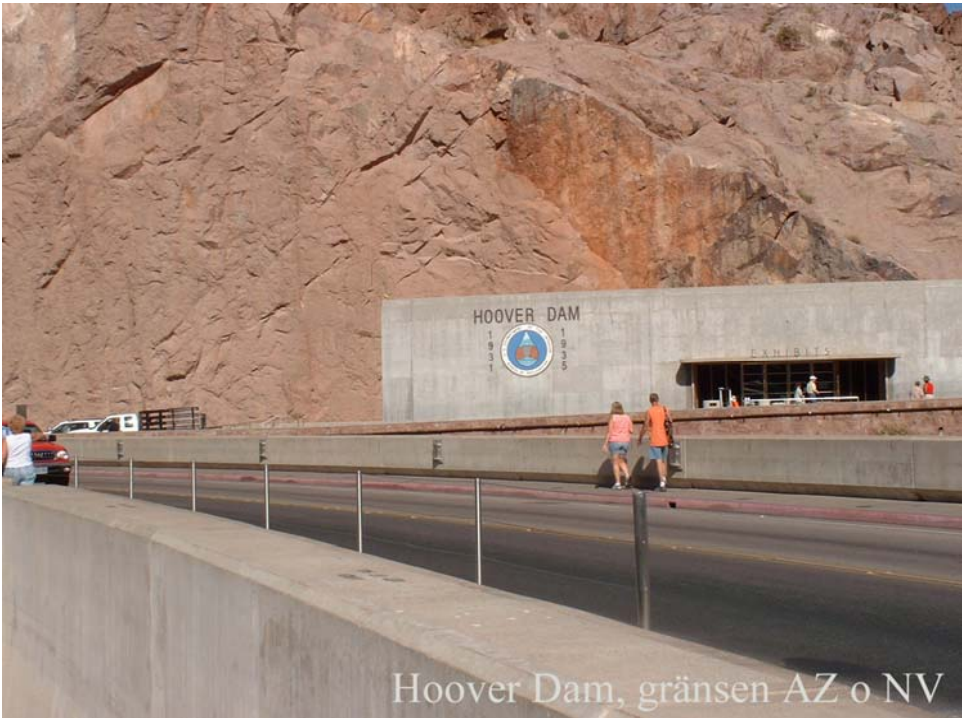
Hoover Dam, gränsen AZ o NV