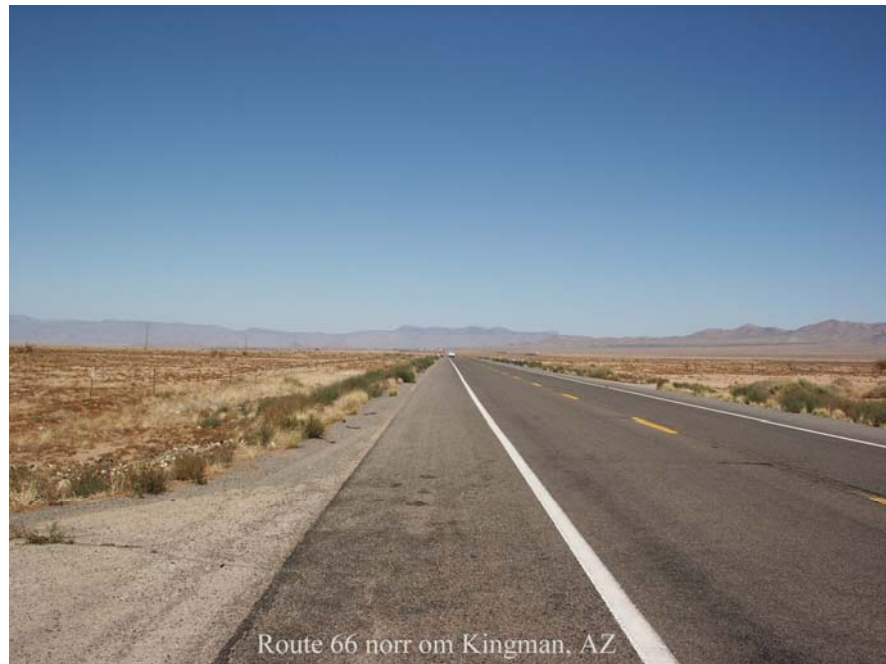
Route 66 norr om Kingman, AZ