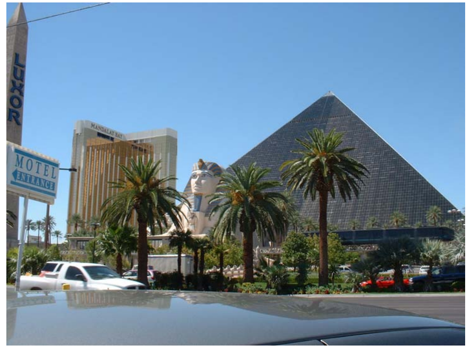
Las Vegas, Nevada