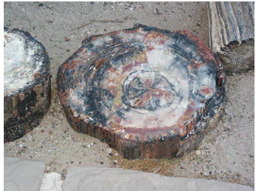
Petrified Forest National Park, Holbrook, Arizona