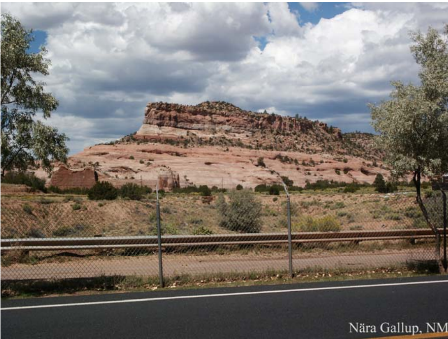
Nära Gallup, NM