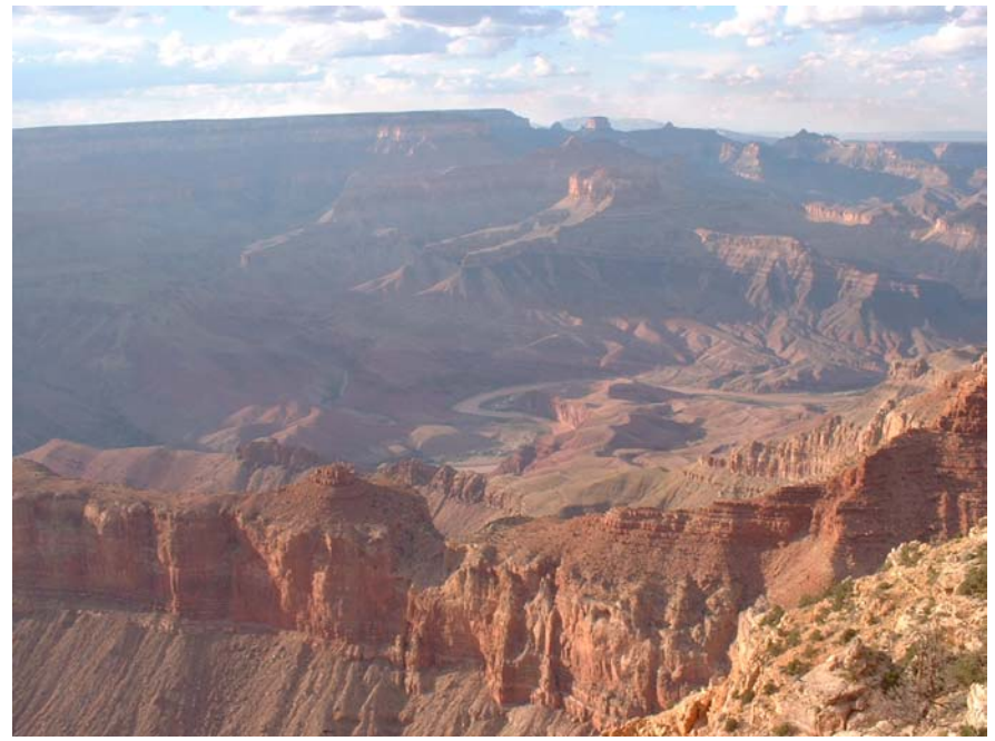
Grand Canyon, Arizona