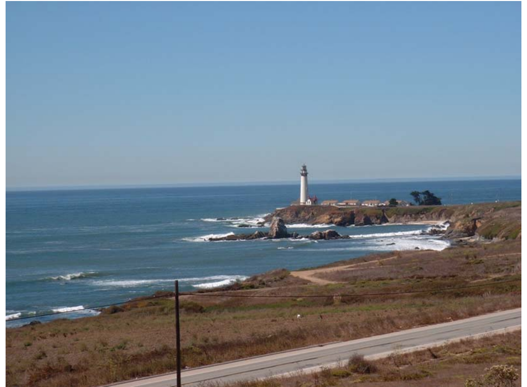
Pidgeon Point Lighthouse