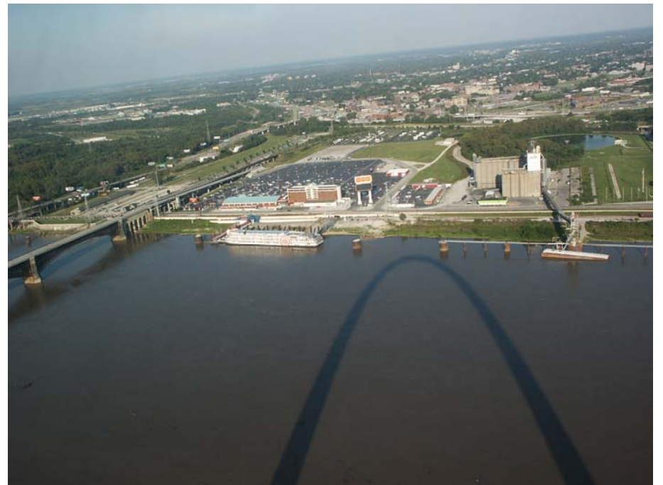
St. Louis, Missouri