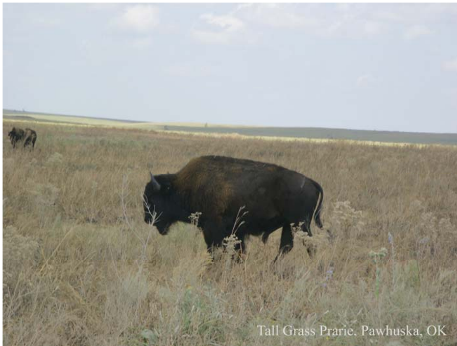
Tall Grass Prairie, Pawhuska, OK