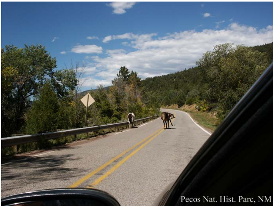
Pecos National Historic Park, Pecos, NM