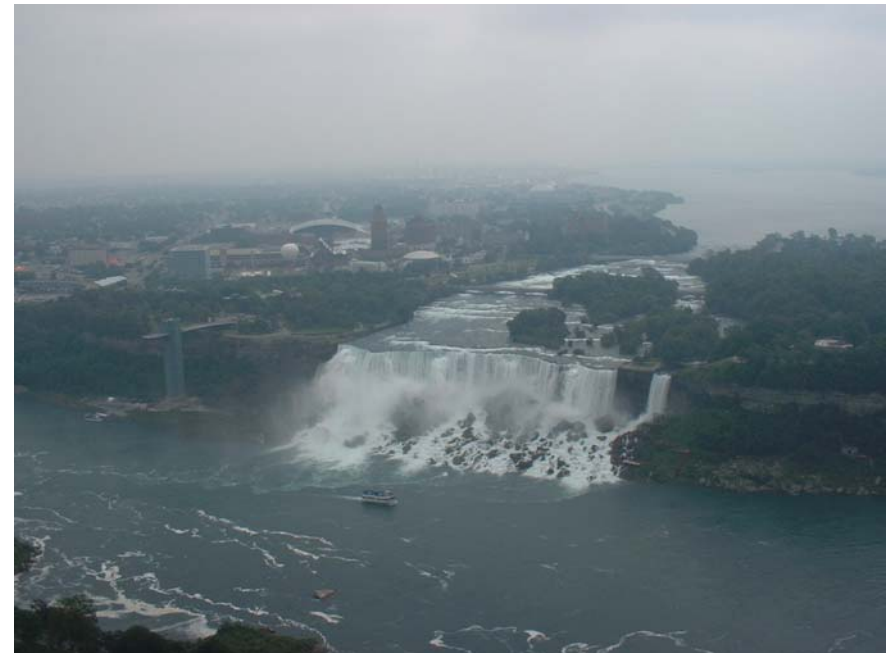
Niagara Falls, Niagara, NY