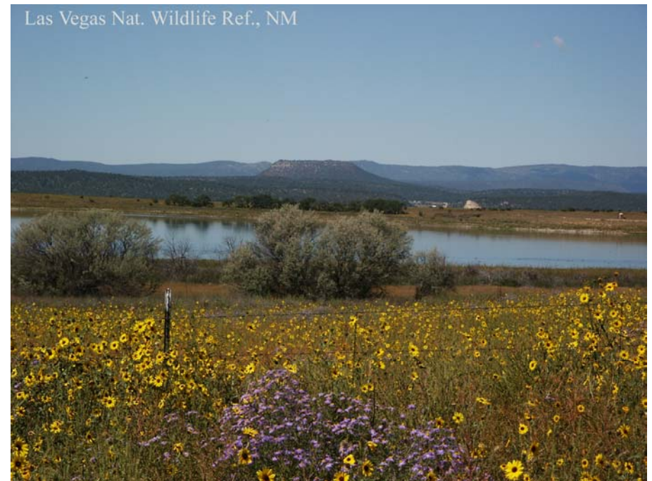
Las Vegas Nat. Wildlife Ref., NM