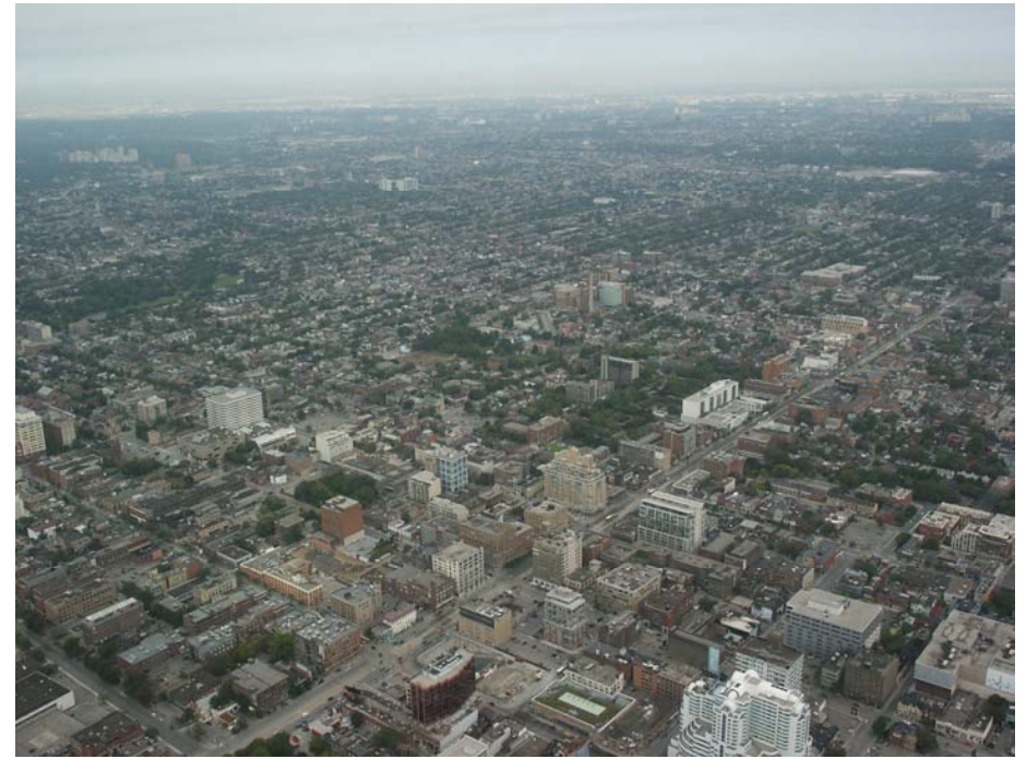
View from Skylon CN Tower Toronto, Canada