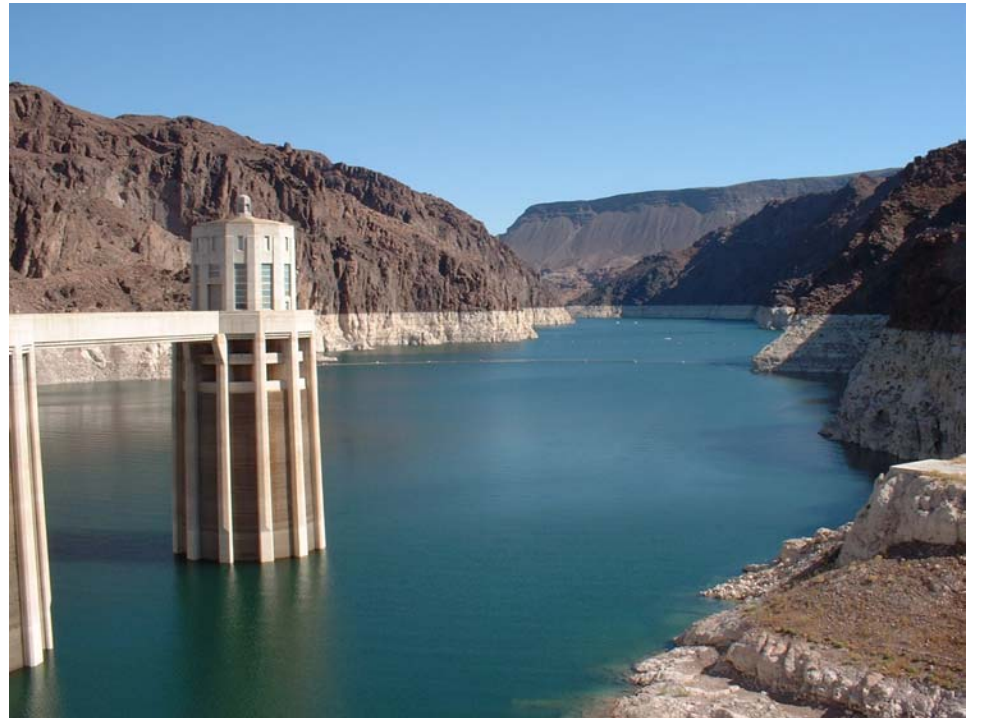
Hoover Dam, Boulder City on border between Arizona and Nevada